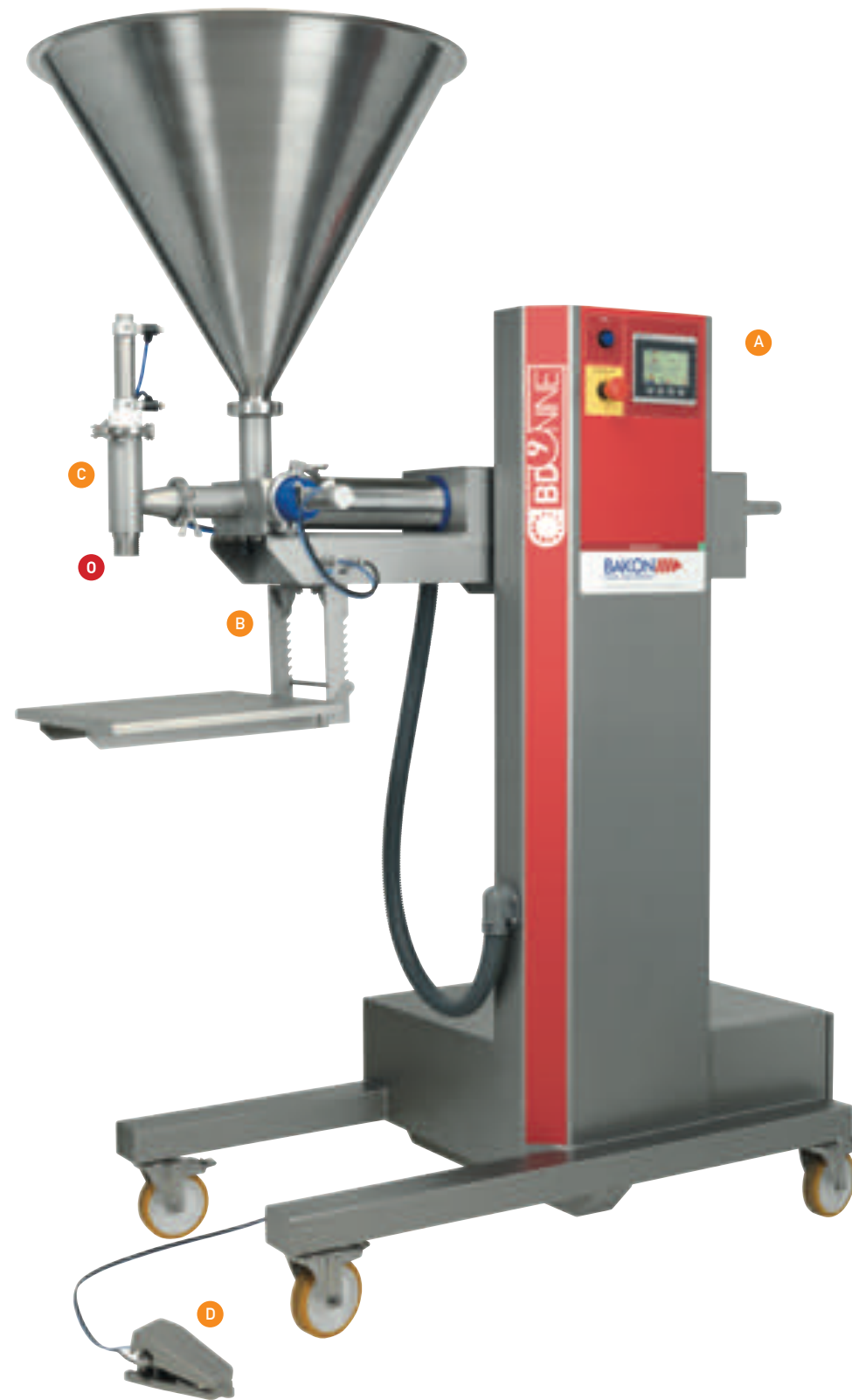
A Full-colour touch screen for storing parameters and recipes