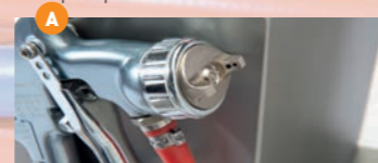
B Control panel for air and liquid pressure