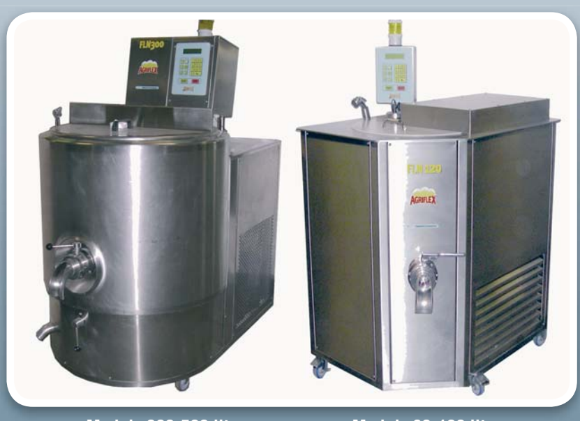
Models 300-500 litres

Agriflex has designed the FLN Automatic fermenter to prepare natural yeast without the need of an expert baker, in 4 models of different capacities on the basis of the customer's production requirements.