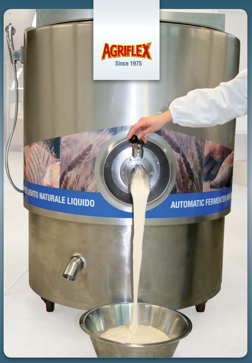
Automatic fermenter for natural liquid yeast